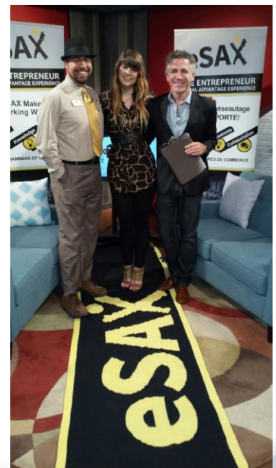
eSAX Sponsorship Packages