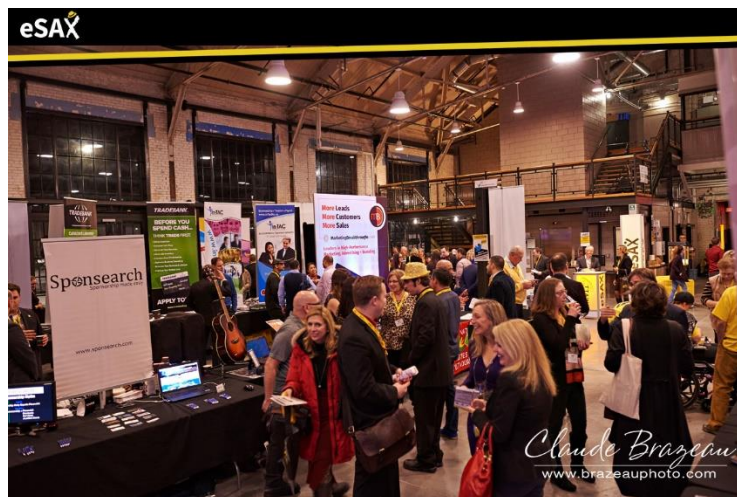
eSAX Exhibitor Details