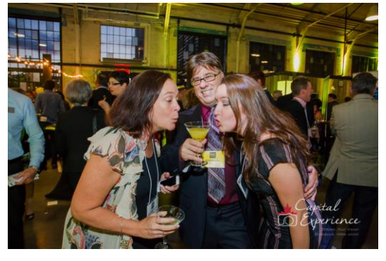
eSAX Sponsorship Packages